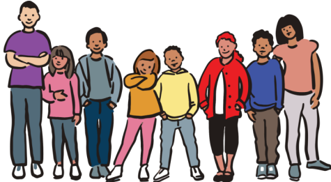
Epworth Children's Home